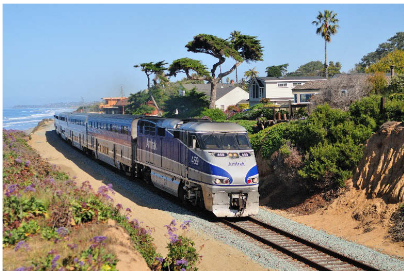
Figure 2: Amtrak Pacific Surfliner train heading south along Del Mar Bluffs

Over the course of several months, the Sub Working Group analyzed the Del Mar stabilization requirements and other goods movement needs within the San Diego Subdivision and crafted a comprehensive grant application for the California Transportation Commission's Senate Bill 1 (SB 1), the Road Repair and Accountability Act of 2017 Trade Corridor Enhancement Program (TCEP). The TCEP program funds infrastructure improvements along corridors that have a high volume of freight movement.