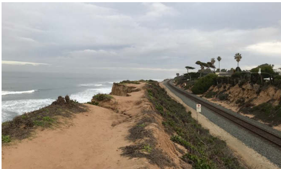
Figure 5: Bluff retreat

Eventually, bluff retreat could threaten the viability of rail service if measures to preserve the portion of the bluff that supports the tracks are not implemented. As part of this multi-phase approach, NCTD first completed an emergency repair in 2001, followed by drainage improvements and installation of a landslide warning system in 2003, and the installation of soldier piles in 2007 and 2010. These stabilization projects saw the installation of nearly 250 support columns into the bluffs and critical investments into drainage infrastructure to help reinforce and protect the Del Mar Bluffs. SANDAG began construction of the fourth phase of improvements in March 2020. The $6 million project is installing support columns that will stabilize localized areas and sea walls, construct a drainage channel on top of the bluffs, repair concrete channels and storm chute outfalls, and stabilize existing headwalls. Improvements are expected to be completed in late 2020. Figure 6 shows past and current stabilization efforts.