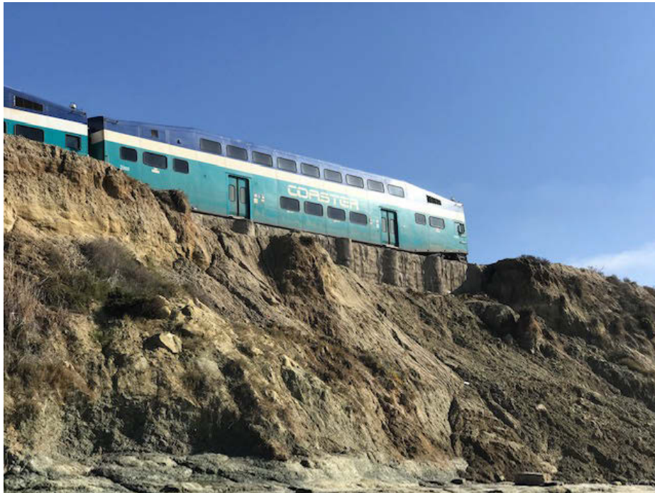
Figure 7: Emergency repairs from November 2019 bluff failure

Figure 7 shows a COASTER train passing over the emergency repair implemented by SANDAG and NCTD following bluff failure in 2019.