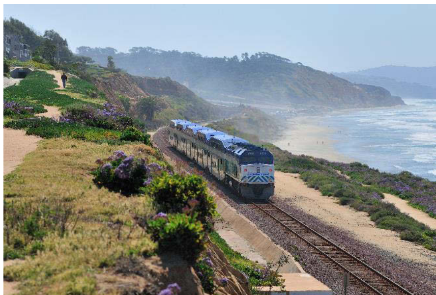
Figure 1: COASTER train heading north along Del Mar Bluffs

Approximately 1.7 miles of the LOSSAN Rail Corridor runs through the City of Del Mar on bluffs located adjacent to the Pacific Ocean (Del Mar Bluffs). The Del Mar Bluffs, which support the railroad infrastructure and track-bed, have experienced and continue to be vulnerable to major erosion events that threaten the stability and viability of the route. The 2018 California State Rail Plan discusses the impact of climate change-induced sea level rise on California’s coastal rail corridors, and specifically references the Del Mar Bluffs section of the LOSSAN Rail Corridor. 1