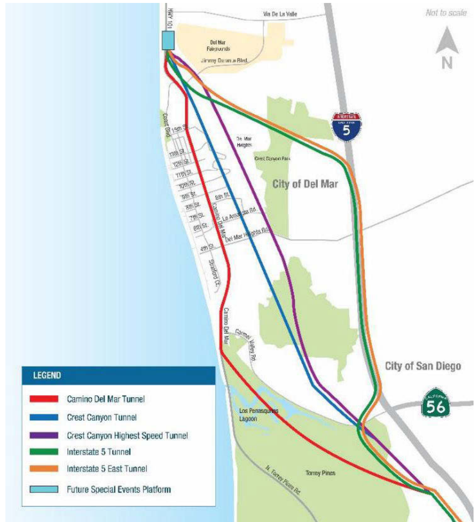
Figure 10: Realignment alternatives