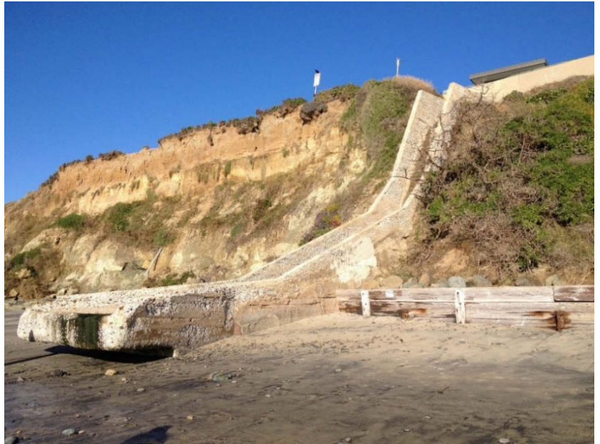
Figure 8: Drainage structure slated for replacement

Phase 6 includes additional stabilization of the bluffs and is anticipated to include minor slope grading and landscaping and installation of bluff toe protection (Figure 9). Phase 6 proposes to incorporate replacement and/or