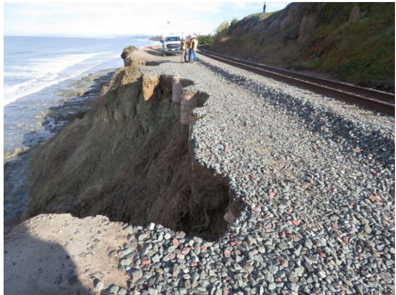
Figure 4: Bluffslide, November 2019

In addition to seismic and slope failure concerns, the large storm events that occurred during the winters of 2018/2019 and 2019/2020 have led to multiple bluff slides and train service interruptions. The bluffs are a receiving point for significant storm water runoff coming from Del Mar Hill. Figure 4 shows the bluff slide during a major rain event on Thanksgiving weekend 2019 resulting from surface drainage over the bluffs, and Figure 5 shows recent bluff retreat.