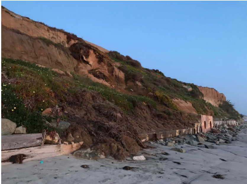
Figure 9: Areas of bluff failure to be repaired in Phase 6

Slope stability enhancements and protection of the bluff toe, in conjunction with previous stabilization efforts, will extend the life of the track structure and allow for continued utilization of this portion of the LOSSAN corridor for passenger and freight rail services.